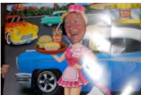
Adele the Roller waitress