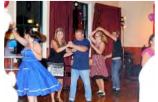
During the Rock n Roll lesson