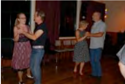
R & R dance lesson