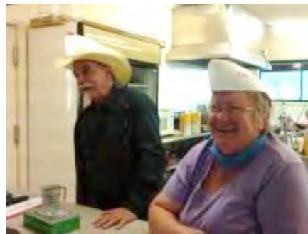
The kitchen staff