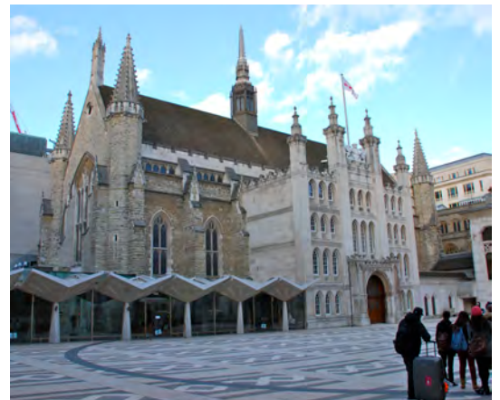
The Guild Hall pictured above escaped the bombing unlike the buildings which were next to it. The devastation was so enormous and deep the crater revealed Roman remains of an arena which is now marked out with a large gray circle on the square.

Still they enjoyed the excursion out of London. Most of the time Louise and Laurie are using public transport as they are only a few metres from the bus stop and the rail is not much more of a distance away. They find they neither miss nor want to bother with a car.