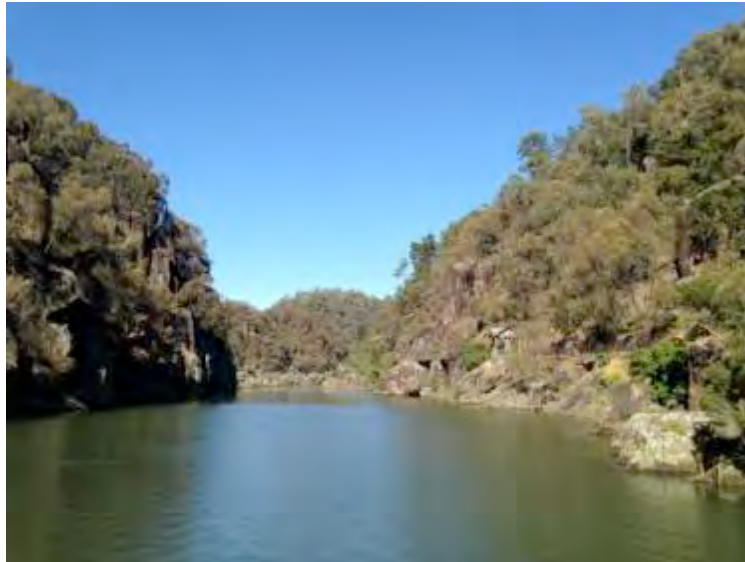
The beautiful Tamar River

This time she spent some time on Cradle Mountain in the rainforest – a wilderness retreat – and managed to take in a Tamar River cruise to get some 'on water' time.