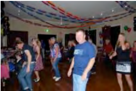
Doing the Bus Stop

It was a wonderful happy community activities night, although at times it was difficult to recognise some of the locals who came wearing wigs and dressed up in 50's gear.