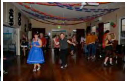
Getting in the mood