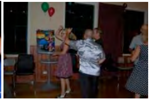
Learning to spin the girl