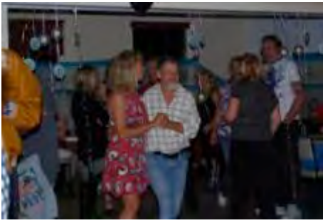
The Rockers crowd