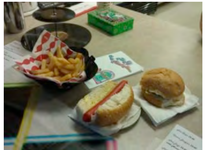
Some of the 1950's priced menu items: Chips $2 Hot dog $2 Cheeseburger $3 Milkshakes were $2 and Spiders $2