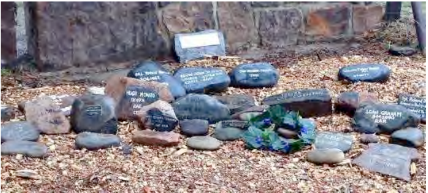
Memorial rocks with one wreath of purple flowers for the animals which sacrificed their lives in all wars.