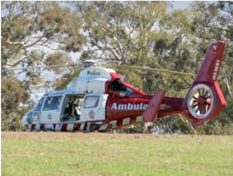
The Victoria Police Air Ambulance attended the patient.