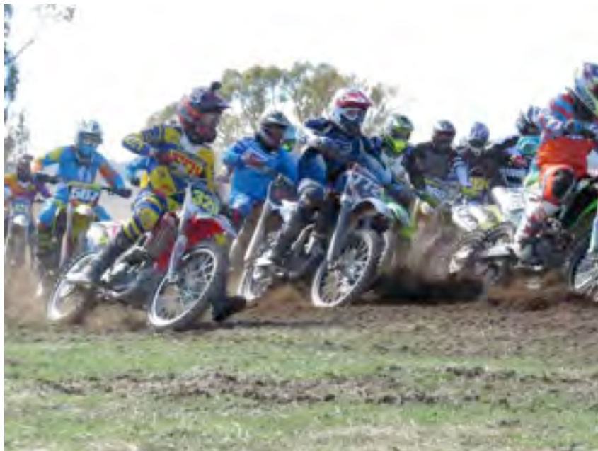
And they're off. In the first of the grass track series on Fridays' farm.

As the Junior Motorcycle Club fundraising activity begins again for 2015, parents and kids are very excited. This series conducted on members' parents' private properties allows mums and dads to also get on the track so the kids don't have all the fun.