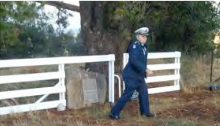
At left, the 5 Pines Memorial site in 2009 the 2 nd year of Merrijig Services.

Our Merrijig Memorial site at the top of Buttercup Road to honour the men and women who served our country in order to protect our freedom has been upgraded. Timed to recognise 100 years since the ANZACs were taken to that ill-fated landing at Gallipoli.