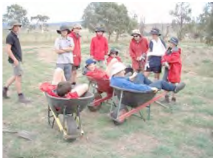
The students on a well-earned break