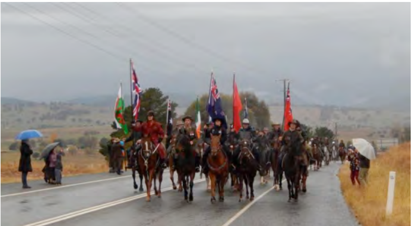
as the parade reached the valley's top

A large crowd was expected for this centenary of ANZAC Day, and there was no disappointment on that level, it may have been even bigger than this picture shows had there not been a thunder storm only a few hours before followed by what would, on another day be called ‘good steady rain’.