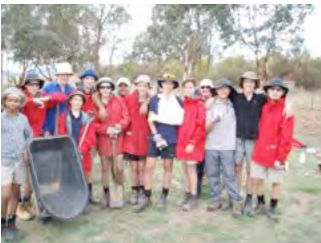
The Timbertop School student clean-up team