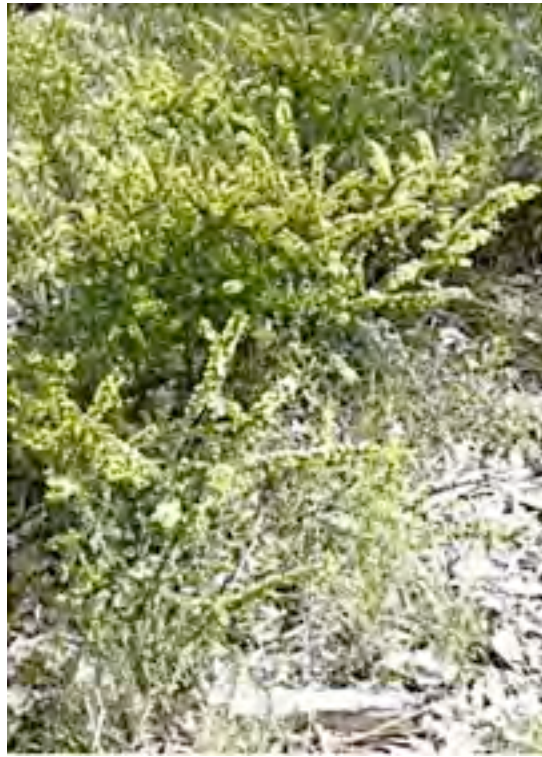
Above photo of Davies Wattles in the wild. They grow to about a metre in height.

Some shrub species to add will be Grevillea (Rosemary Grevillea - a good one for the area - the local Small Fruit Hakea with narrow leaves and great little white flowers, whose botanical name is Hakea microcarpa . This grows locally near Eagles Peaks and in the Nillahcootie area. You may know of it from elsewhere in the district.